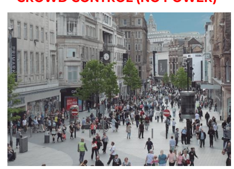
PUBLIC SPACE SURVEILLANCE