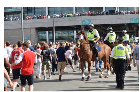
CROWD CONTROL (NO POWER)