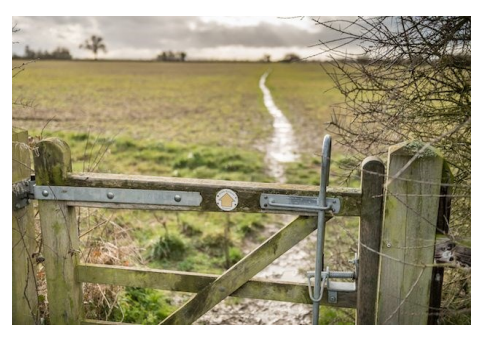
REMOTE LOCATIONS (NO POWER)